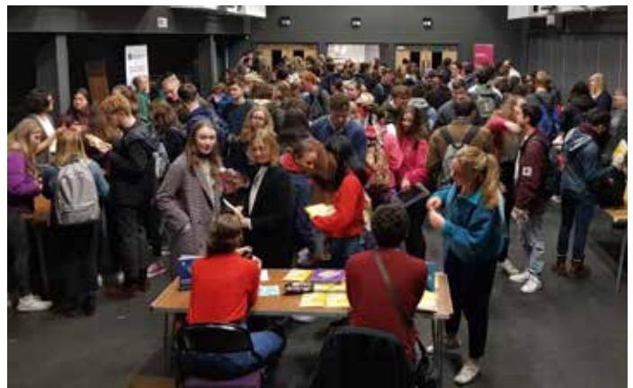
Above (left to right), Volunteers helping with Raisin Weekend, the Accommodation Fayre in Semester 1.