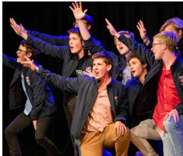
Above: A Capella Society (The Other Guys)